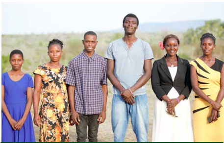
Chakama Community School Staff

Some of the highlights from 2024 include: regular parent and community meetings, school uniforms, a school field trip to Mombasa, and school shoes for the kids. The school management washed and oiled the children's feet before helping them into their new shoes. For most children these were the first shoes they had ever worn.