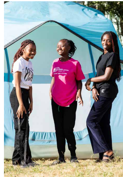
Members of the 2024 class of New Beginnings.