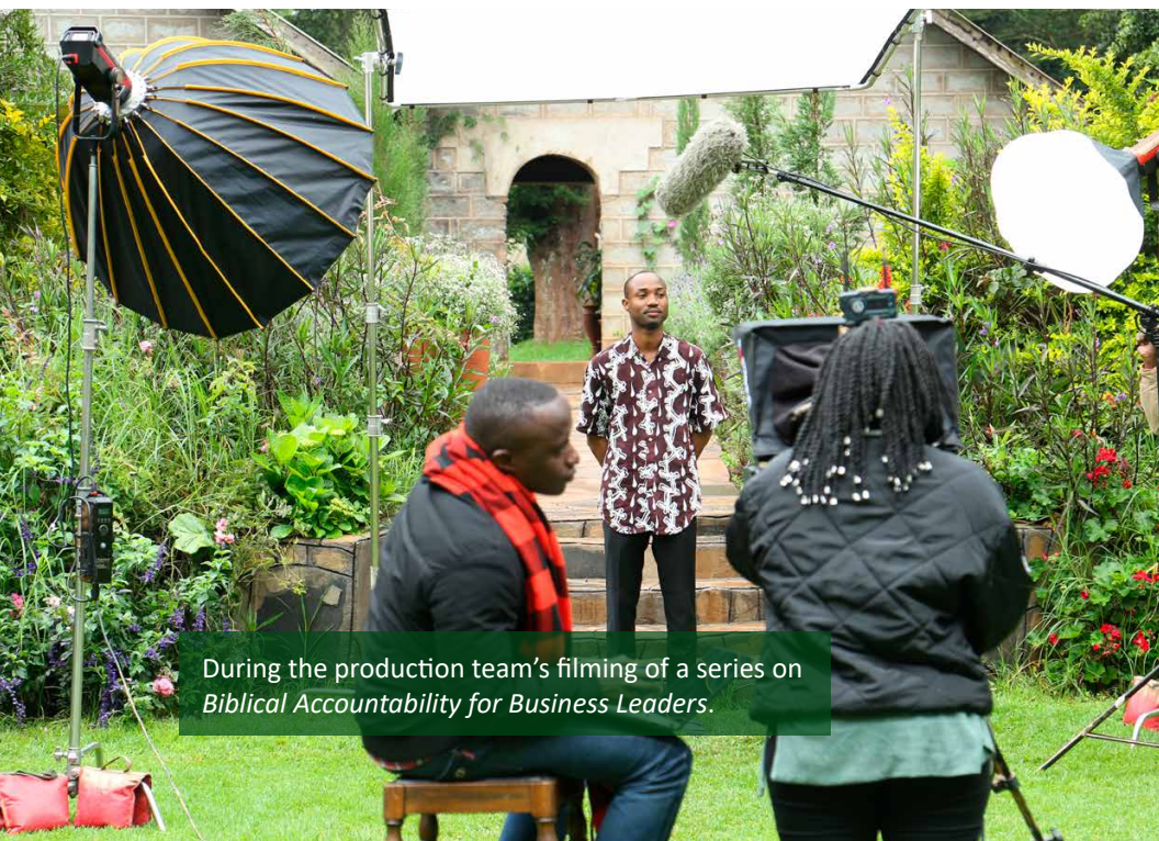
During the production team's filming of a series on Biblical Accountability for Business Leaders .

The support of friends like you made it possible to incubate and shepherd the Inspiring Hope Company. Our ministry team is now in the process of building an apprenticeship network to provide additional internship opportunities for recent graduates. Our first apprentice in 2024 was placed with a sales management team at one of the Africa's largest health and hygiene product providers. He impressed the company so much with his character and service they offered him a full-time position.